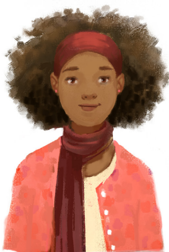
JUVENILE RHEUMATOID ARTHRITIS